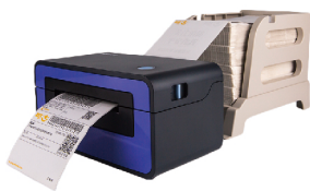
Optional Accessory: External label holder