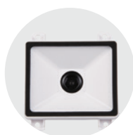
Multiple interface choices