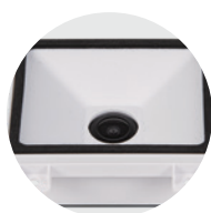
Ultra large recognition window