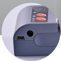
Direct USB Charging(Optional)